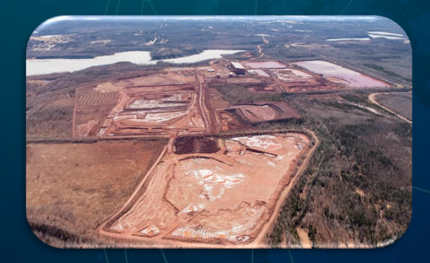
Plant 4 Overhead Photo